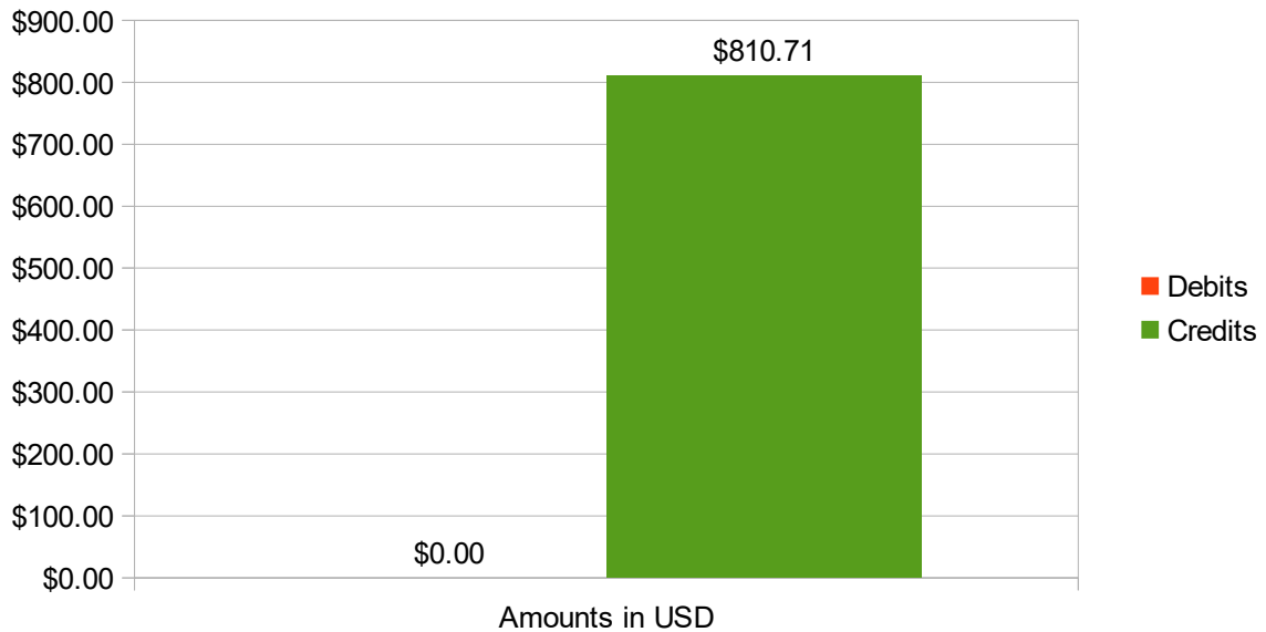
June 2017 Fire Dept. Debits & Credits Chart