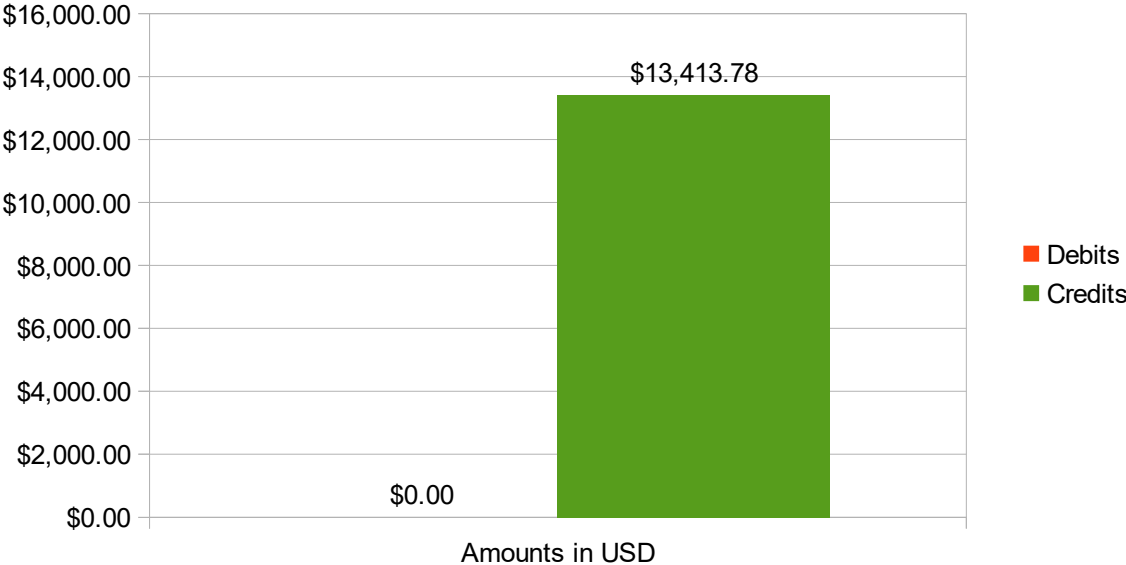
September 2017 Fire Dept. Debits & Credits Chart