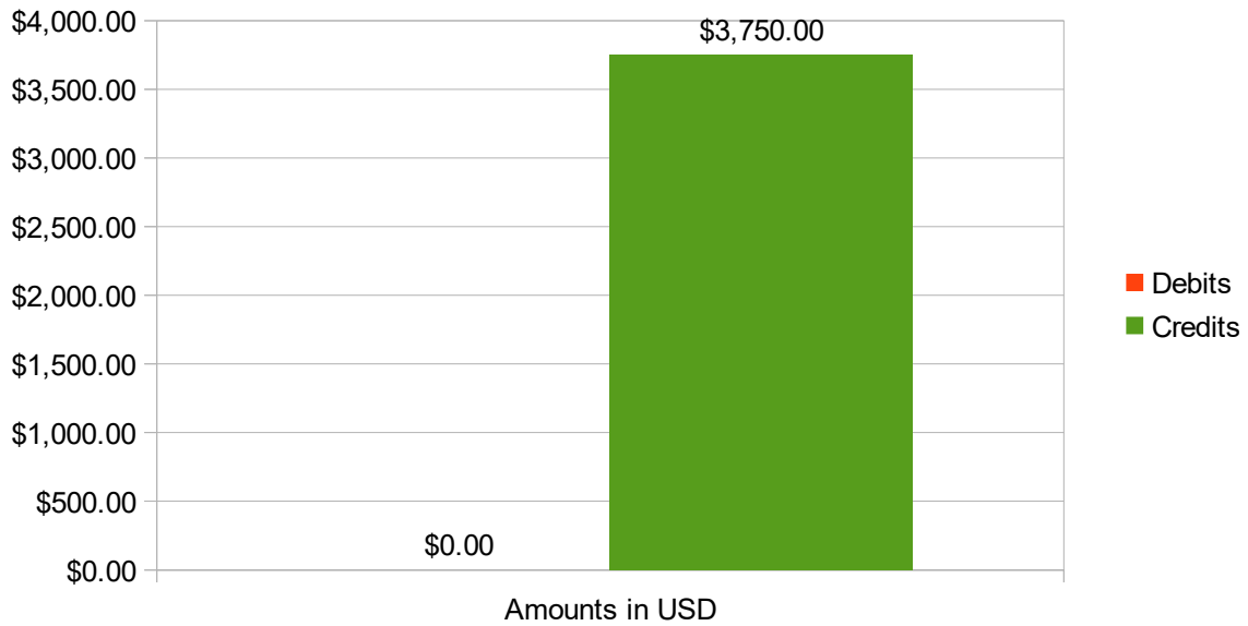
October 2017 Fire Dept. Debits & Credits Chart